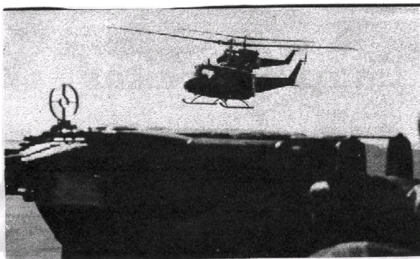
THE MORNING SUN silhouettes a machine-gun mounted on the side of a helicopter while two other aircraft fly in close formation. The machine-guns used on the helicopters are regular M-60s, such as the Infantry uses, adapted with a sight and special trigger mechanism.

as a life line for the Special Forces "A" camps scattered throughout the II Corps Tactical Zone, air-lifting much needed supplies and evacuating personnel.